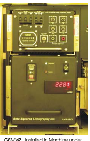
GFI-LVR Installed in Machine under A.C. Power & Lamp Control Ass'y.

Beta Squared Lithography , Inc. announces its new GFI Line Voltage Regulator is now available for sale.